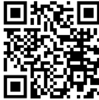
QR code for Career Discovery App

Each area contains videos that walk you through using the resources.