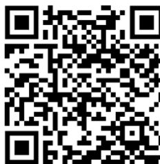
QR code for Career Discovery in D2L

This is a resource within D2L that includes several Career Discovery resources to help you in your career journey. You can use this link to self-enroll in the resource.